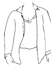
Shirt over Undershirt